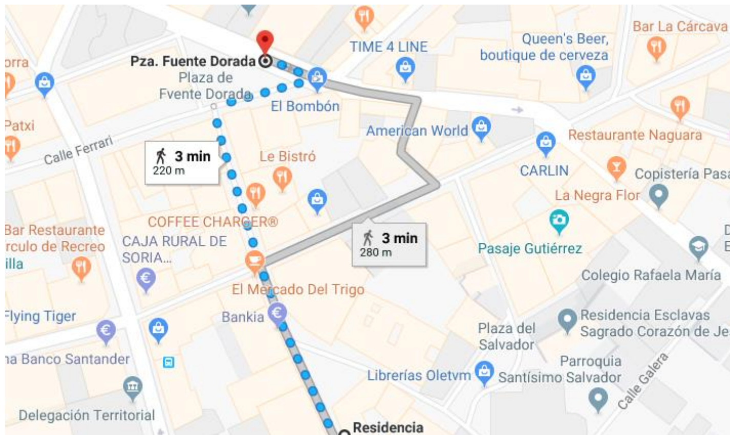
MAP 2 - FROM THE UNIVERSITY RESIDENCE REYES CATÓLICOS TO THE BUS STOP