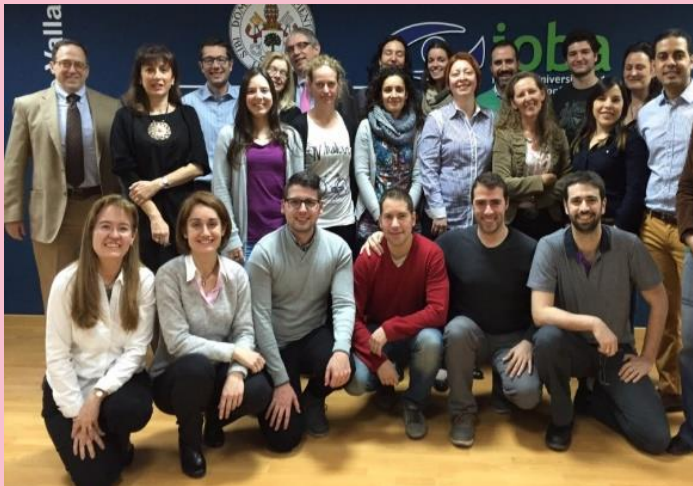
Ocular Surface Group

The Institute for Applied Ophthalmobiology (IOBA) from the University of Valladolid is located in the University Campus Miguel Delibes. It was established in December 1994 and has been dedicated to visual sciences for more than 20 years.