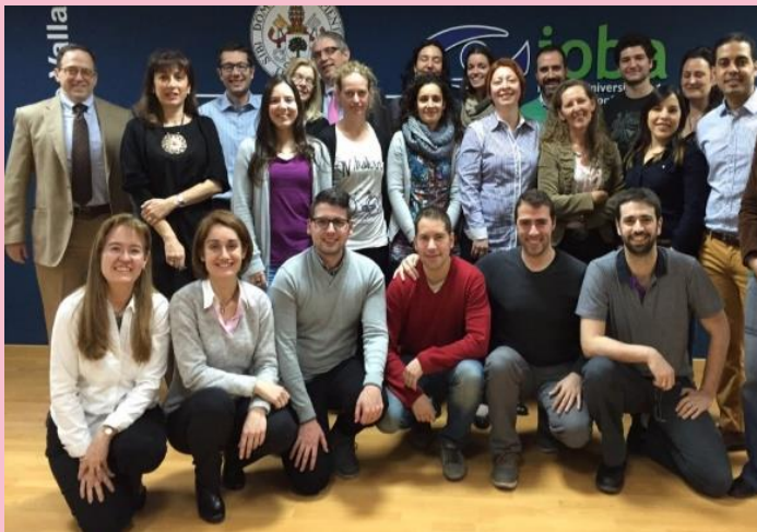
Ocular Surface Group

The Institute for Applied Ophthalmobiology (IOBA) from the University of Valladolid is located in the University Campus Miguel Delibes. It was established in December 1994 and has been dedicated to visual sciences for more than 20 years.