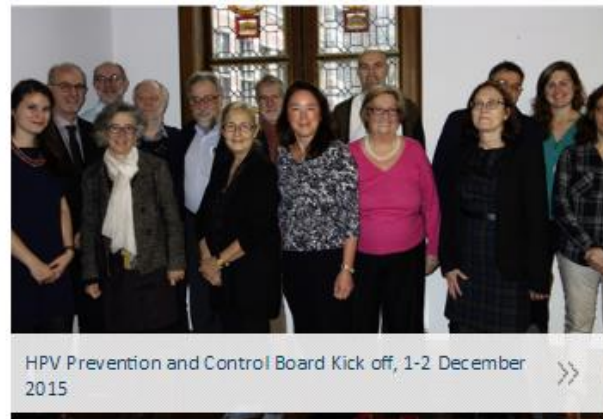
HPV Prevention and Control Board Kick off, 1-2 December 2015