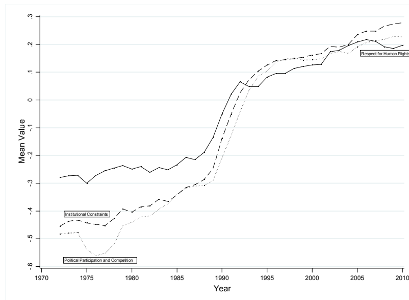
Figure 3. Mean Evolution of Political Participation and Competition, Human Rights and Institutional Constraints. 1972 - 2010.

Note. Dots = Political Participation and Competition; Dashes = Institutional Constraints and Solid Line = Human Rights.