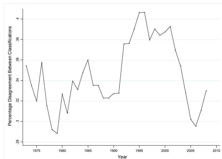
Figure 1. GWF, WTH and CGV Regime Typologies Compared. 1972 - 2010.