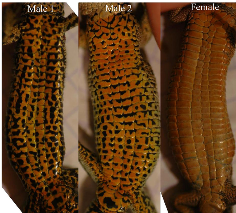
Figure 1. Pictures of the ventrum of two male and one female Zootoca vivipara , demonstrating the extent of the variation in the percentage of ventral melanin-based colouration. This figure is published in colour in the online version.

The reflectance spectra of the lizards were measured with an Avantes spectrometer (AvaSpec-2048-USB2-UA-50 (range 250-1000 nm), Avantes, Eerbeek, The Netherlands). The probe was held perpendicular to the skin surface. The measurements were expressed relative to a white reference tile (WS2, Avantes, Eerbeek, The Netherlands). The lizards' colouration was assessed by measuring the reflectance at thirteen positions: on the head (spot 1); dorsal, between the fore limbs (spot 2); mid-mid on the dorsum (spot 3); mid-lateral (both left and right; spots 4 and 5); lateral (both left