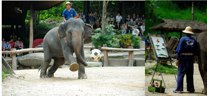
Figure 4: Elephant rides as a tourist attraction