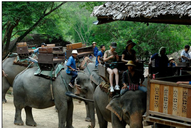
Figure 3: Elephant rides as a tourist attraction

With elephant trading declared a criminal offense, according to Wolverson (2014), it is difficult to conclude that elephant trafficking has been totally eliminated. This is because of how valuable an elephant is in terms of monetary value. The demand for elephants in the tourism industry is also increasing given that the number of visitors to Thailand increases from 26.7 million in 2013 to 28 million in 2014, as reported by Wolverson (2014). Despite the political instability in Thailand in 2014 wherein the number of tourists fell by approximately 5 percent between January and April, elephant rides as an attraction remain to be popular and elephant tourism remained to be lucrative in India, Cambodia, and Lao PDR (see Figure 3).