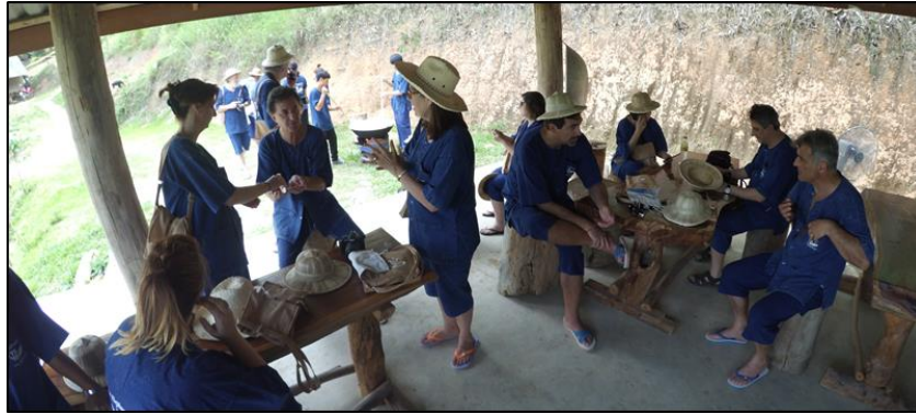
Figure 6: Mahouts in training