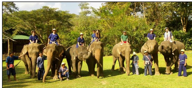
Figure 5: Tourists as mahouts riding elephants

Apart from day visits to watch an elephant show and to ride an elephant, and similar to NEI, visitors can take a short mahout training course (half day or one-day program) to spend the time and learn more about elephant's nature. In general, the course begins with an introduction of an elephant's anatomy, health care, body language to communicate with elephant, basic commanding and handling, bathing, feeding, riding, elephant museum and cemetery visit, and painting lessons. The mahout will teach the participants, step by step, and at the end of the program, successful participants will be awarded with certificate of achievement. This hand on practice is a memorable experience for participants to understand a life of mahout with his heart of elephant (see Figure 6).