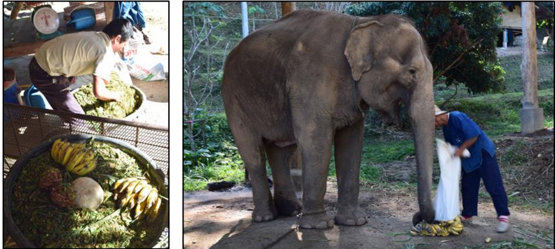
Figure 7: Elephant feeding