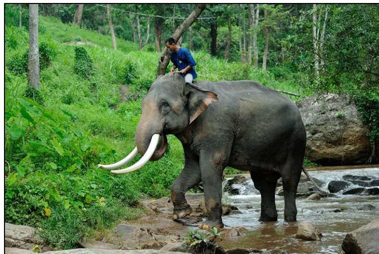
Figure 1: a domestical elephant with his mahout

Thailand is known as one of the primary habitats of the Asian wild elephant ( Elephas maximus ). It is one of the 13 economies in Asia that trades Asian elephants to fuel its tourism market (Wolverson, 2014). According to the Thai Elephant Conservation Center 3 (TECC) (n.d.), its current population of domesticated elephants is approximately 2,700 from a population of 100,000 during the 1850s. Furthermore, as per the statistics from TECC (n.d.), about 95 percent of Thai elephants are in privately owned, with the TECC's 80 elephants being the Kingdom's only state-owned elephants other than from a few in zoos and the King's ten revered white 4 elephants in the Royal Elephant Stable 5 .