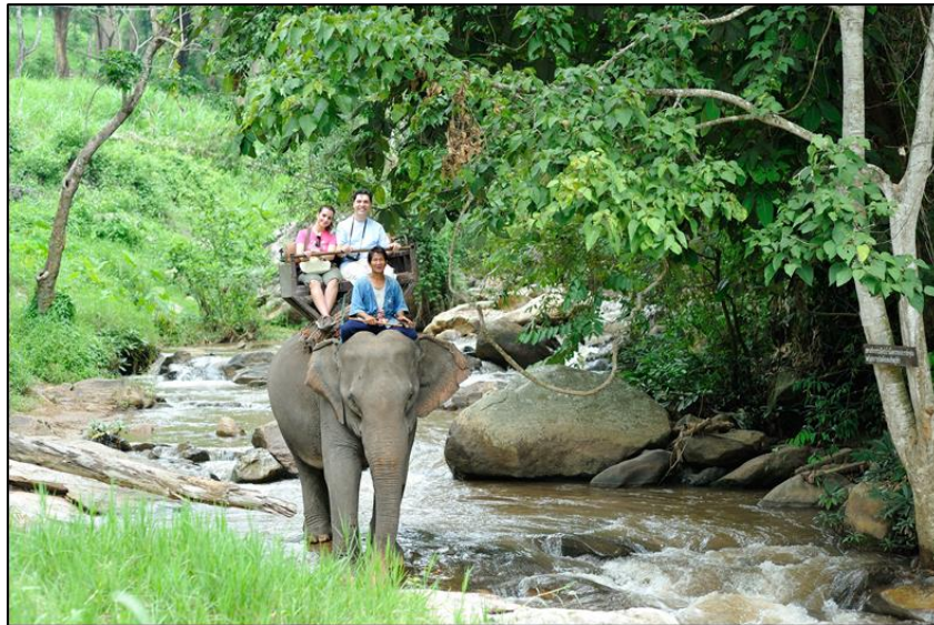
Figure 2: an elephant with his mahout and tourists

In the previous century, elephants were employed for logging; and poached for their skin, meat, and ivory. In 1989, the Thai government regulated logging and prohibited it in protected areas. Consequently, it closed all natural forests and elephant trading was declared to be illegal (Wolverson, 2014). For environmentalists, this is a very favorable decision but elephants that were employed in logging became unutilized. With the rapid growth of tourism in Thailand, the elephants now play a vital role in providing entertainment and exhibits. In the contemporary period, most Thai elephants are employed in the tourism industry (see Figure 2) – in elephant camps.