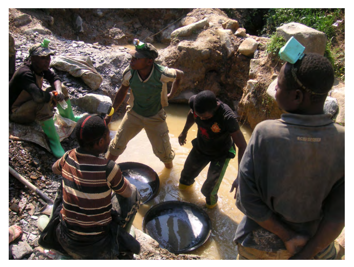
Fig. 2. Artisanal miners in Kamituga

In terms of alternative activities, especially technical professions (such as mechanic and carpenter) and small trade activities were considered appealing. Most of our interviewees abandoned school at a young age, however, and have little or no professional experience outside of mining. Another frequently mentioned concern echoes that "everyone in Kamituga is a gold digger", referring to miners' impression that the entire economy of Kamituga depends on money generated by the artisanal mining sector. They wonder who will be able to pay for non-mining services if the gold from artisanal mining no longer fuels the local economy?