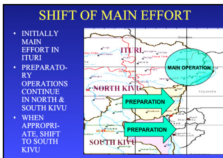
Figure 1. MONUC Campaign Plan, March 2005