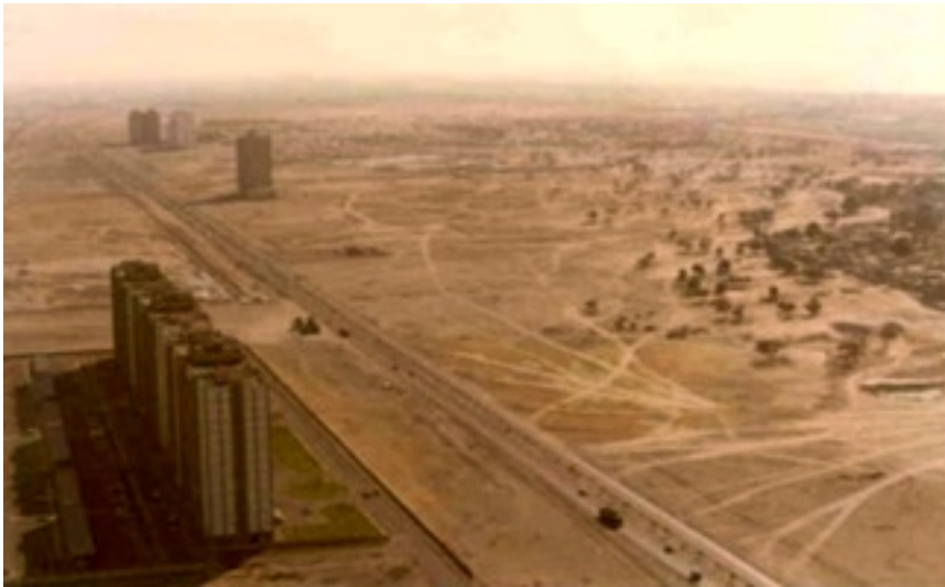
Dubai in the '90s

Dubai has been marketing itself heavily around the world in the past few years, especially in the West. The reason: money. With estimated oil reserves for 7 years that contribute roughly 10 % of GDP Dubai is looking for alternatives. Tourism is one of them. The marketing strategies it employs in the West are deliberately chosen to attract not just any tourist but wealthy ones - the type of tourist who will stay at 5-star hotels (not a youth hostel in sight here), dine in fine restaurants, buy luxury goods, and spend foreign currency in the emirate. Investing in tourism is securing future revenue streams and Dubai is gambling that the investment will pay off.