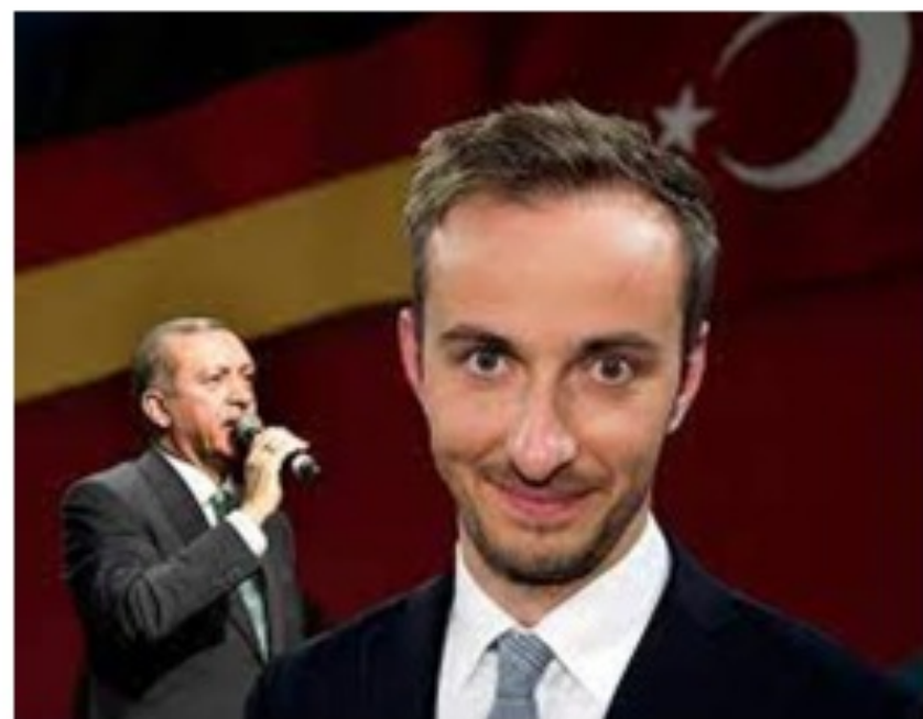
Jan Böhmermann Germany