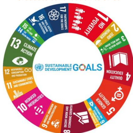
Graduate contribution to SDGs