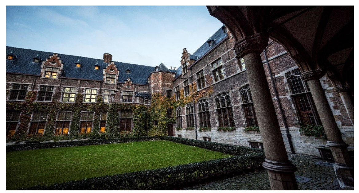
Photo: Entrance, small courtyard at Prinsstraat 13, the historical wing of the Hof van Liere

University of Antwerp, Prinsstraat 13, 2000 Antwerpen, Belgium - Tel: + 32(0)3 265 41 11